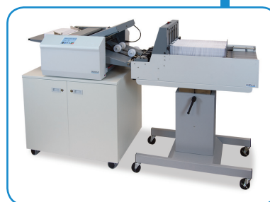
FD 2056 in-line with optional V-Stack36i Vertical Stacker, stand and cabinet

Formax - New Hampshire, USA www.formax.com