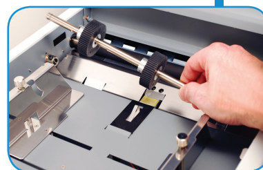
Removable Feed Wheels