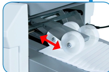
AutoStack™ Stacker Wheels